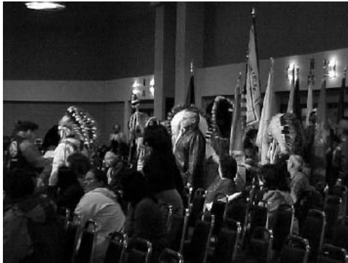
The Opening Ceremony and Posting of Colors by Northwest Veterans

when veterans from the Northwest Tribes began the meeting by posting colors and representing their tribes. As they filtered by the microphone set near the stage, the