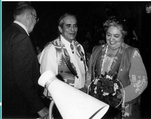
Who said "I do...?"

vice tribe is preferable for them. I do understand that the decision to remain a direct service tribe is also self-determination. Yakama, Spokane, Makah, Warm Springs, and Colville are more than just the remaining federally operated health programs to me. They are also the tribes that have contributed to the