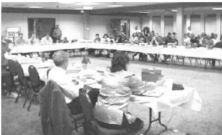
NW Portland Area Indian Health Board Delegates