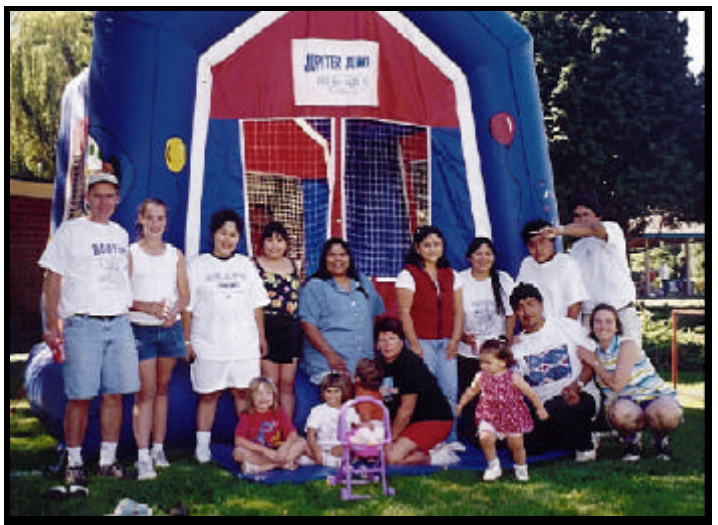
September 11, 1999, Staff and family members joined together at Blue Lake to enjoy a fun and relaxed Saturday with good food, fun activities and great company!