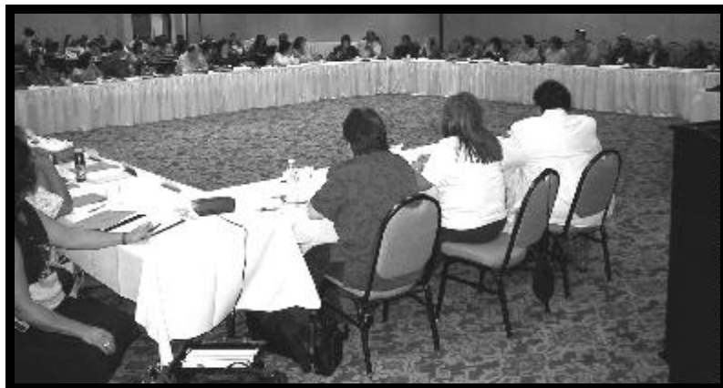
NPAIHB and CRIHB gather together to vote on Resolutions ( Please see page 11 for Resolutions passed).