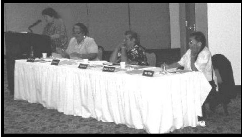
The Executive Committee hard at work and doing thier job well.